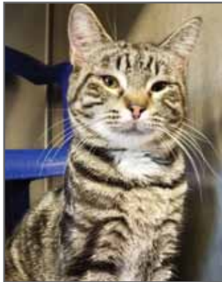
Hope (Now Willow) & Angel (Now Minerva)

sister, Angel. The wonderful staff and volunteers helped us immensely that day.