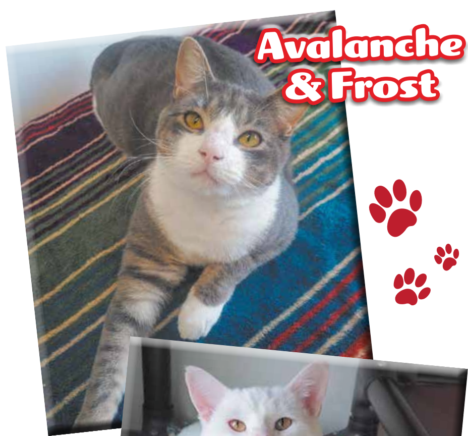
Avalanche & Frost

Matilda caught my eye the second I saw her photo in the “available cats” post on Facebook. Upon meeting her, it was confirmed she was coming home with us. Matilda was a surrender, she was very shy & timid and it was expected to take a little time for her to adjust. When she came home, she knew she was home because within a couple hours she was cuddling up with her new brother, Gunner (4yr old Aussie mix) and sprawling out on the couch and bed. Matilda has become one the most cuddly, loving, and calm cats I’ve ever met, her beauty is inside and out. Never pass on the shy ones, as they can blossom into the best fur babies you could ever ask for. I thank you SPCA for having the open door to take her in, and for trusting me to give her the best home possible.